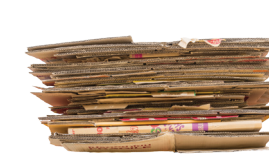
CARDBOARD Dry & Flattened No Food Contact