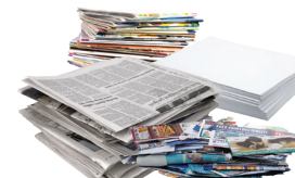
PAPER Newspaper, Office Paper, Junk Mail & Magazines