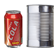
CANS Aluminum & Steel