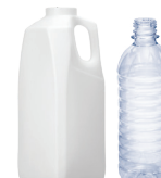
PLASTIC Bottles & Jugs, 1, 2 & 5